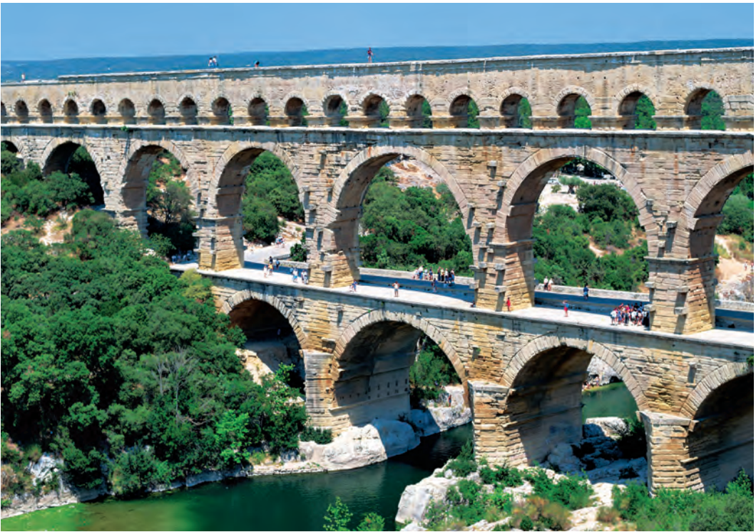
The 1 st -century Pont du Gard aqueduct

and the Tour Magne, the only remaining tower of the original city walls. Later we depart for Avignon, capital of Christendom in the Middle Ages. Here we visit the historic city center with its 12 th -century Romanesque Cathedral; the remains of the Saint-Bénézet Bridge; and the Palais des Papes (Papal Palace), one of the world's most important Gothic structures. Tonight: a small group highlight as we join a local chef for a Provençal cooking class followed by dinner. B,D