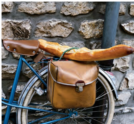
Typical French scene

Thursday, October 30: Dijon/Chablis/Paris En route to Paris today, we stop in Chablis, renowned for its signature dry white wines. We enjoy a walking tour of the medieval village and visit the 13 th -century Collégiale Saint- Martin church. Then we have time on our own for lunch and to explore as we wish, maybe by visiting one of the wineries in the town center. Mid-afternoon we travel on to Paris, where an orientation tour takes us past many of the city’s highlights. Dinner tonight is on our own in this city of fine cuisine. B