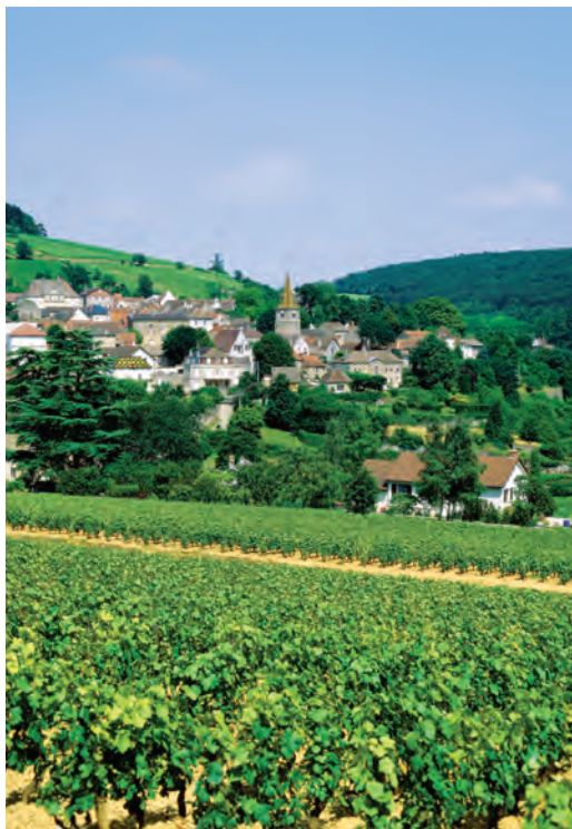
We travel Burgundy’s wine route.

Friday, October 31: Paris This morning we visit the Opéra Garnier, the opulent theater that stands as a symbol of the city (and as the setting for The Phantom of the Opera ). If Opéra Garnier is not available, we’ll tour the Musée Rodin, dedicated to the works of sculptor Auguste Rodin. Our afternoon is free for independent exploration; tonight we celebrate our Gallic sojourn over a farewell dinner. B,D